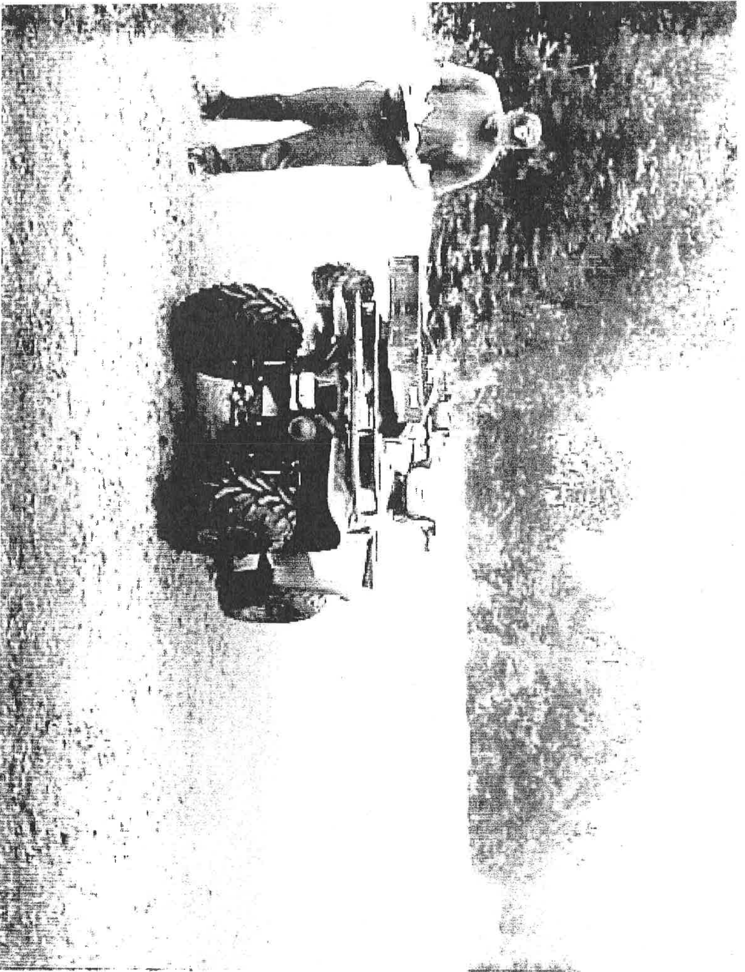
7-11 N. in. of West Side Rd. - Fortius South