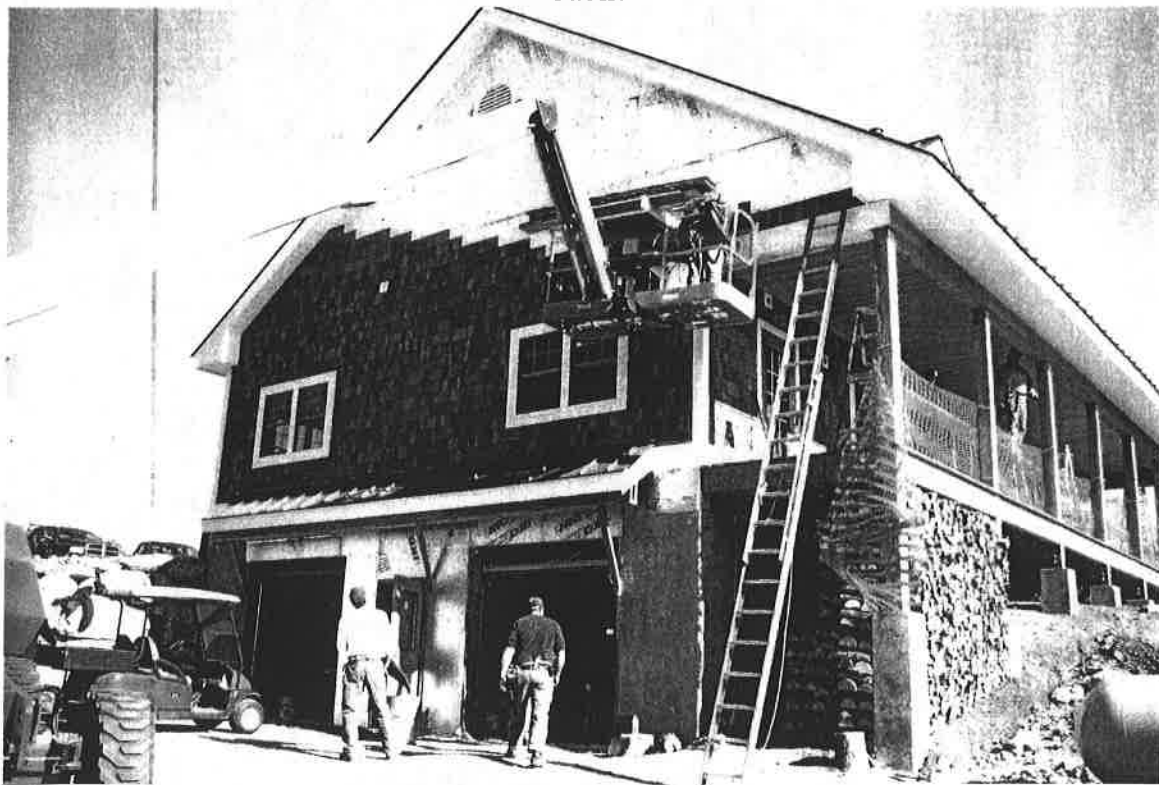
Exterior finishing of Visitor's Center