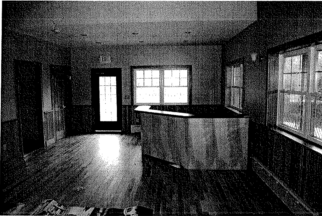
VISITORS CENTER MAIN ROOM VIEW #1