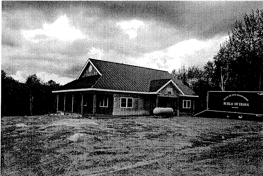
VISITOR'S CENTER, NORTH SIDE