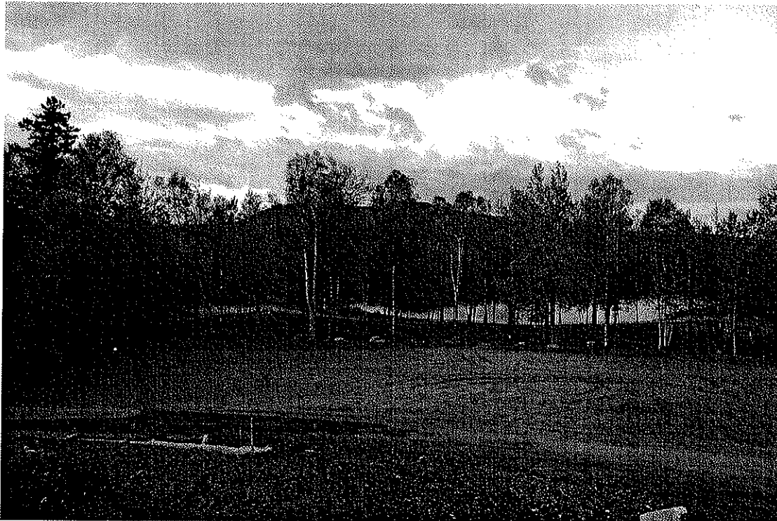
SOUTH VIEW FROM VISITORS CENTER