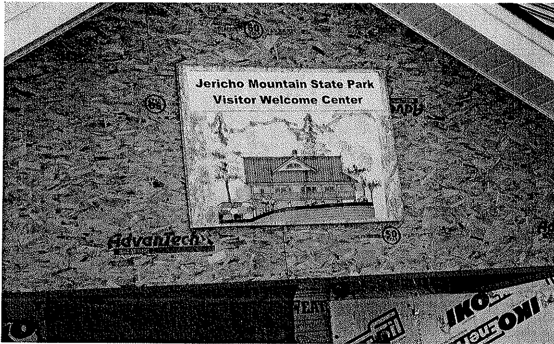
VISITOR CENTER CONCEPTUAL DESIGN