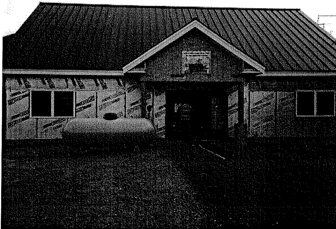
VISITOR CENTER NORTH SIDE