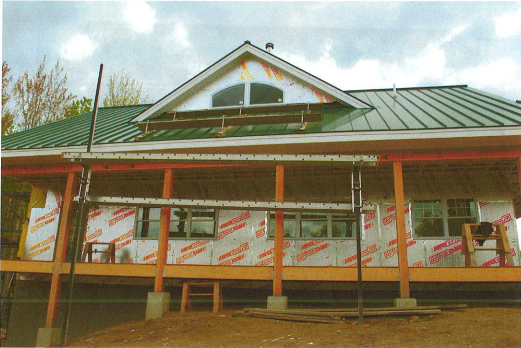
VISITORS CENTER FACING SOUTH