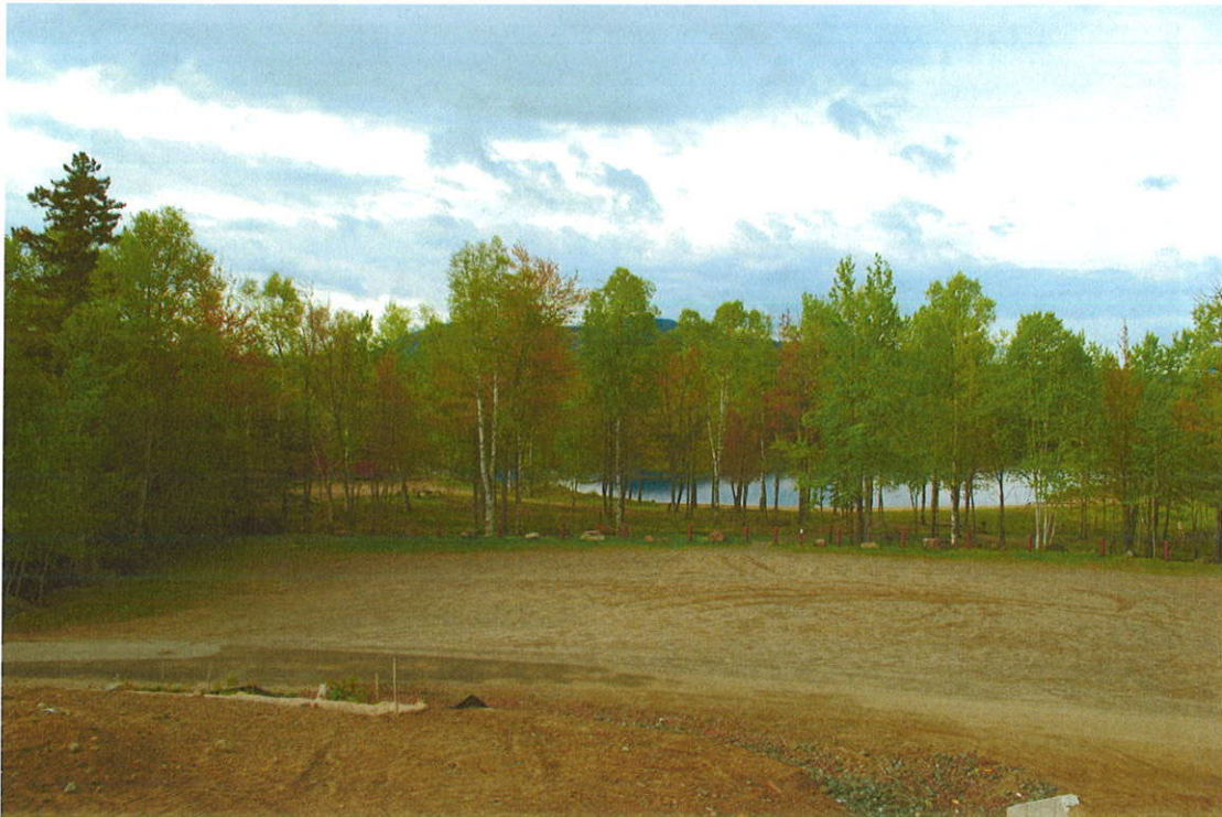
SOUTH VIEW FROM VISITORS CENTER