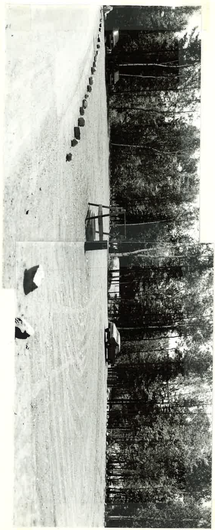
#33-00464 Jericho Lake Park - Berlin Final Inspection 7/17/84 Jobs Bill