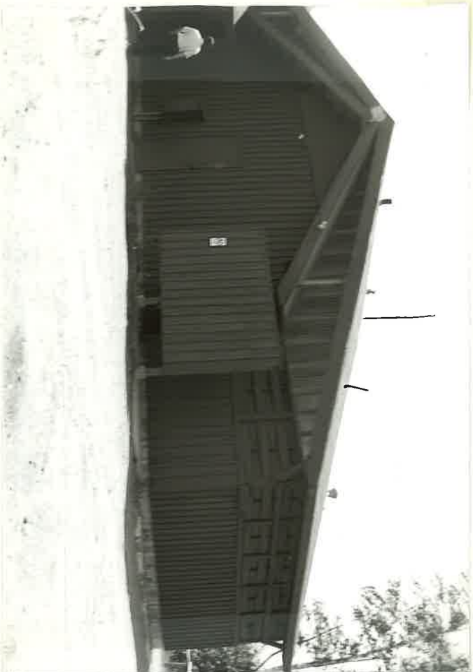
Bathroom - new roof built-up.

#33-00464 Jericho Lake Park - Berlin Final Inspection 7/17/84 Jobs Bill