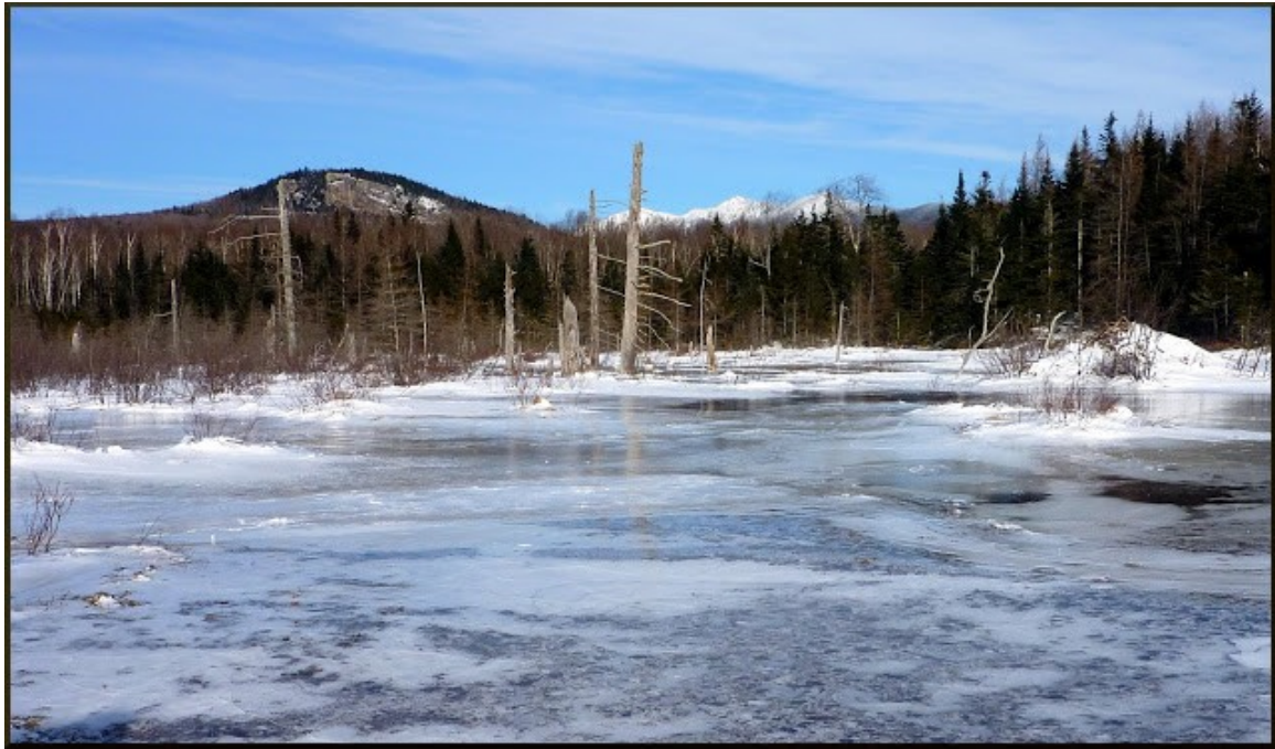
Bog Eddy and Mt. Pemigewasset