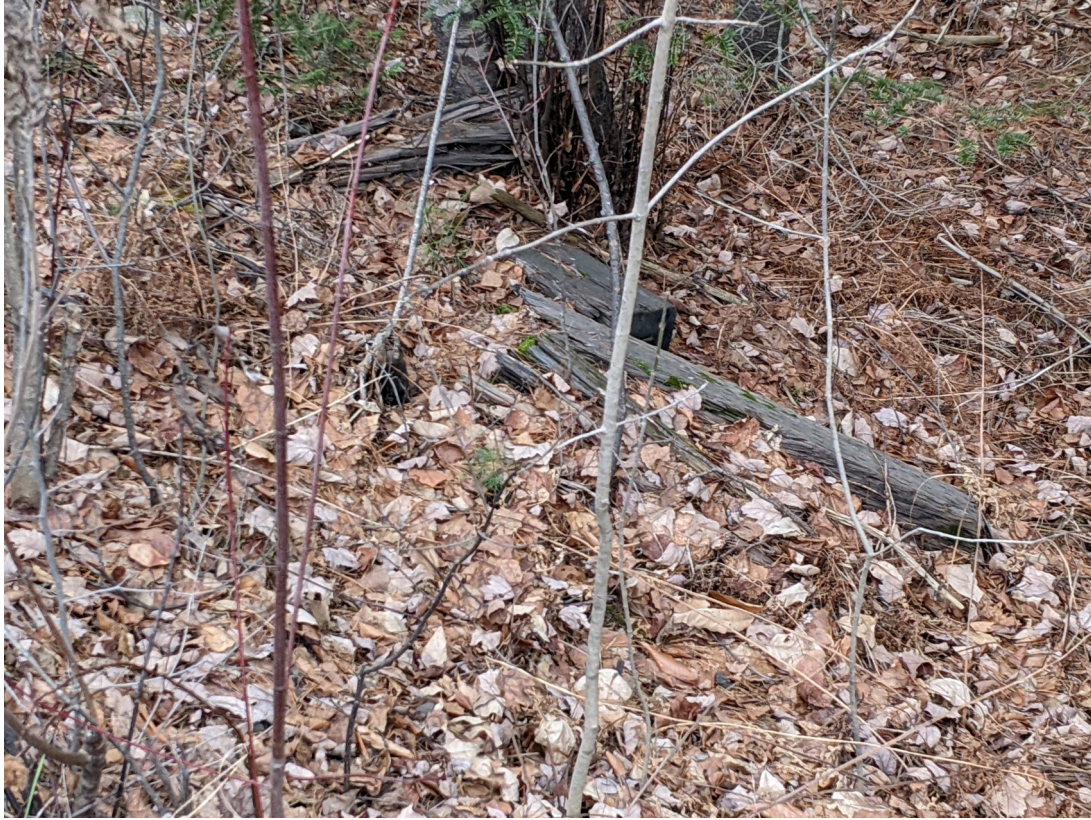
What appear to be railroad ties, dumped on the north slope of the Ammonoosuc Rail Trail between Industrial Park Road and the I-93 overpass.