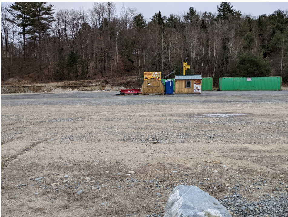
Below: HammerDown Adventures parking lot looking south from the Rail Trail.