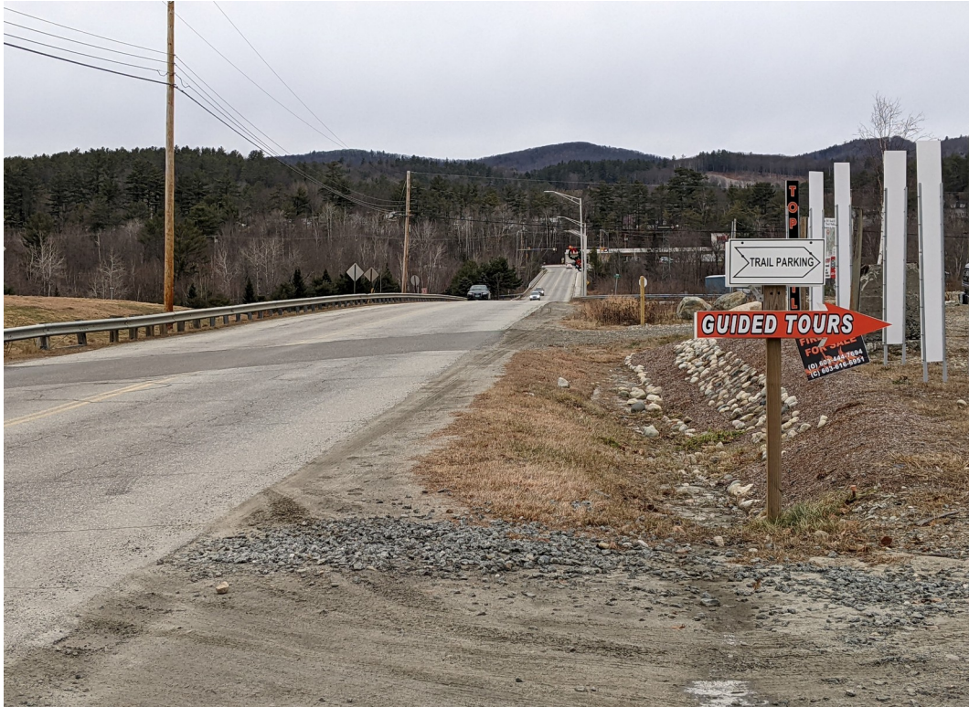
Above: Looking north, the Ammonoosuc Rail Trail crossing of Industrial Park Road is indicated by the darker pavement. The HammerDown Adventures parking lot is on the right. A sign forbidding OHRVs from heading east is near the large rocks partly obscured by the Guided Tours sign.